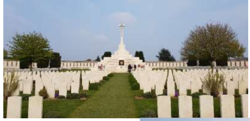
Two images Of Tyne Cot Cemetery